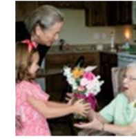
Join in floral deliveries and directly impact community members.

As a member of the Perennial Society, you are invited to