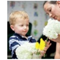
Prepare and arrange flowers with volunteers.