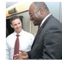
Help with strategic initiatives and represent RAF in the community.